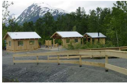
Facilities are not far from the track.