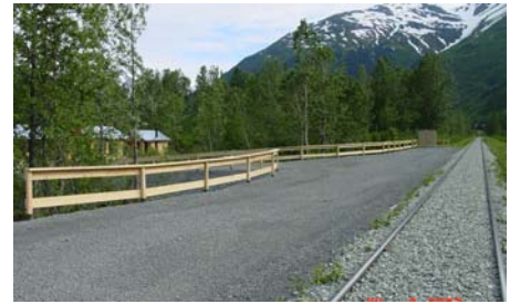
Passenger platform beside the track.

A two-sided kiosk inbetween shelters offers interesting insight into the area. Shelter interiors feature interpretive items as well.