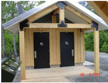
Toilets and trash receptacles.

U.S. Senators Ted Stevens (Alaska) and Daniel Inouye (Hawaii) attended a formal grand opening on August 16, 2007. This project milestone coincided with the Chugach National Forest's centennial celebration.