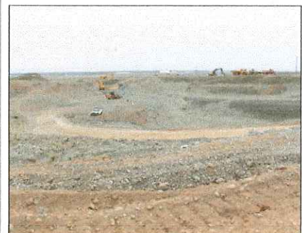
Tiffany Sukola/Columbia Basin Herald

Construction of a 30-million gallon storage lagoon, which is part of the Port of Moses Lake's waste-